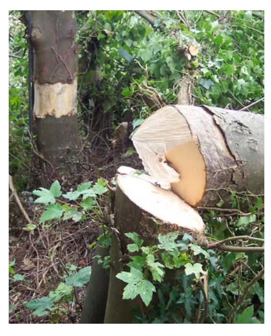
3.3 In most cases where work is proposed to a protected tree, the